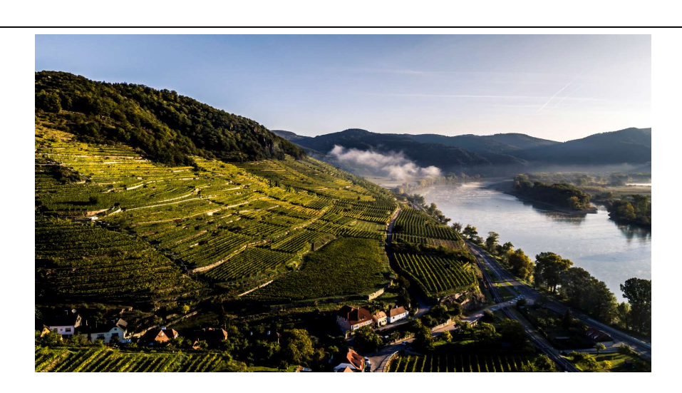
Wachau terraces — river Danube valley

Partners : Wine school Krems, Horticultural school Langenlois, BAUAkademie NÖ Dry Stone Walling School Austria Société scientifique internationale pour l'étude pluridisciplinaire de la Pierre Sèche